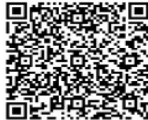
Zelle QR Code