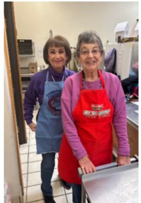
Joy and Sunny our wonderful volunteers!