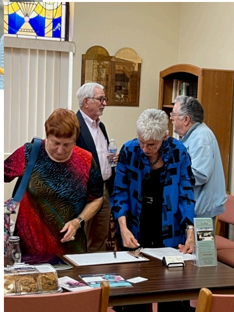
Answering questions after the program