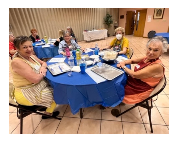
Waiting to start