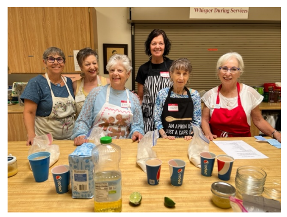
The set up crew